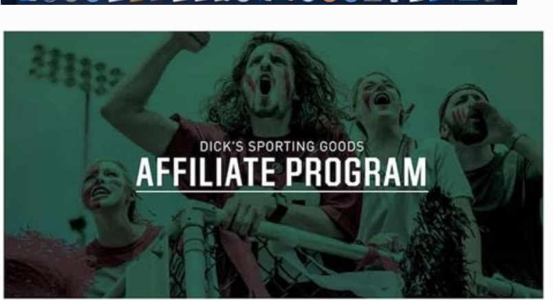
Team up with DICK'S Sporting Goods and make more money! Every time you direct customers to DICKS.co and they make a qualifying purchase, you earn a commission.